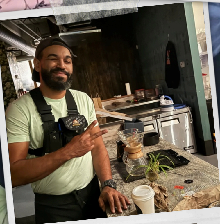
tineo dominguez grip & electric